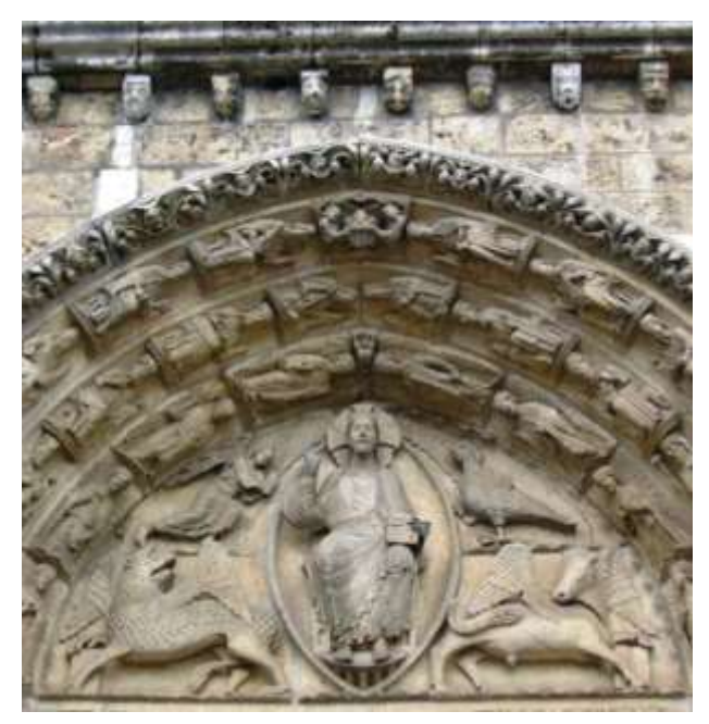
Christ in Majesty among the Four Living Creatures, Chartres Cathedral, France

"The Sovereign Lord says to these dry bones I will make breath enter you, and you will come to life." Ezekiel 37:5